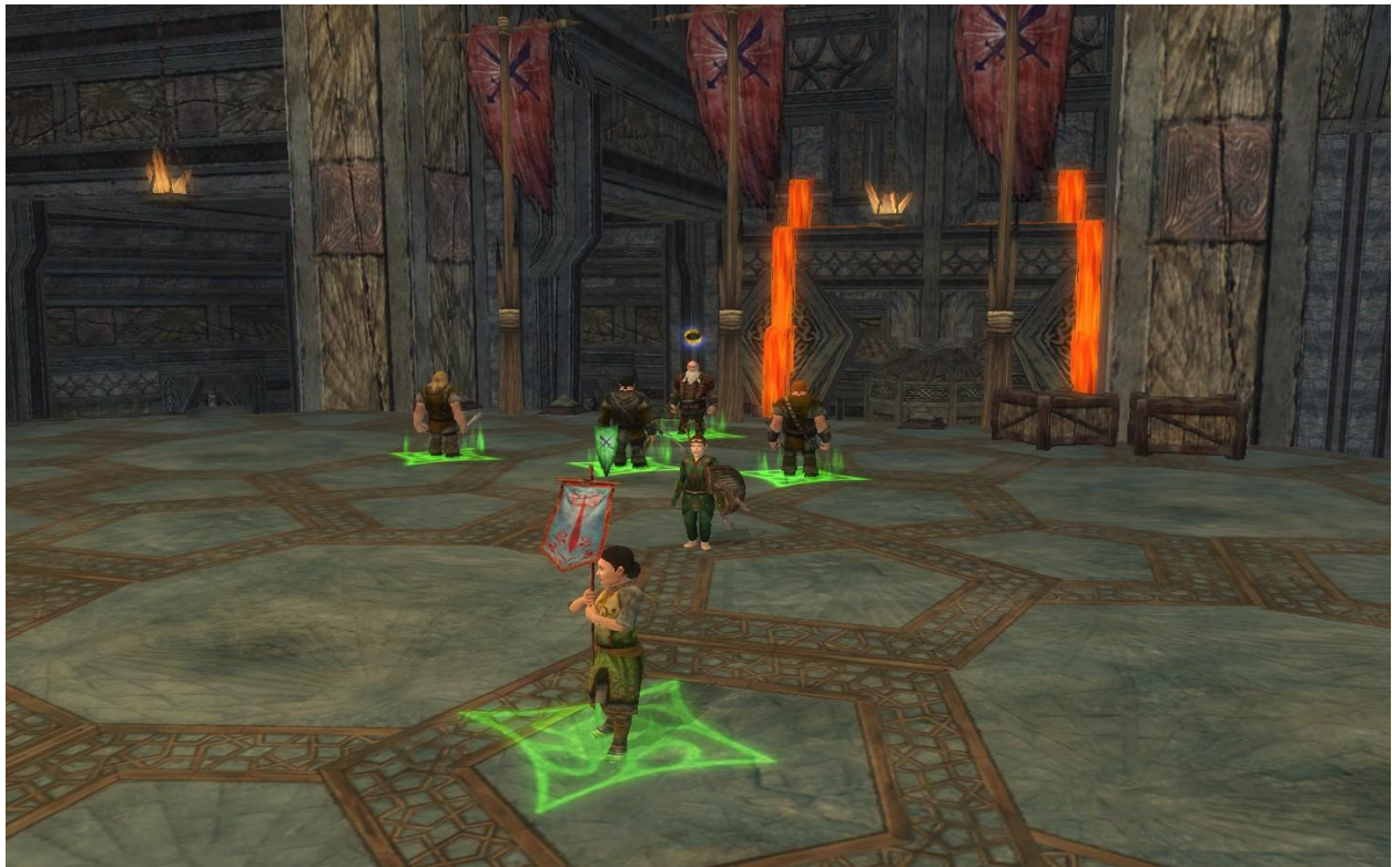
Pineleaf and her bannerguard Blackberry prepare to defend the Way of Smiths

Follow the latest LOTRO news at LOTRO Players at http://www.lotroplayers.com